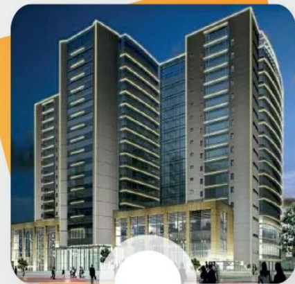
BUILDING LIGHTING SYSTEMS